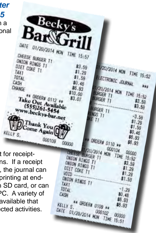
Receipt Featuring Graphic Logo and Message Shown 75% Actual Size

Single printer models are best for receipt-only or journal-only applications. If a receipt and a sales journal is needed, the journal can be archived electronically for printing at end-of-day, can be collected on an SD card, or can be polled and collected by a PC. A variety of electronic journal reports are available that allow you to quickly audit selected activities.