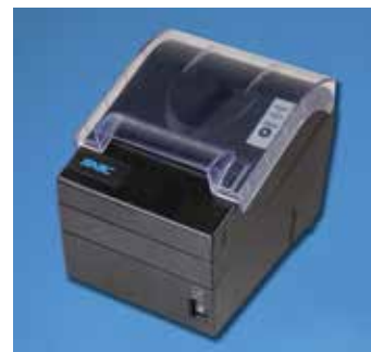
Optional Spill Cover