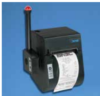
Built-In Wall Mount Capability and Optional Audio/Visual Print Messenger