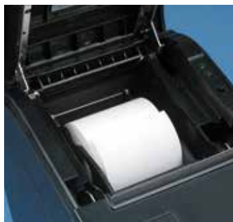
Drop and Print Paper Loading with an Adjustable Paper Width Selector