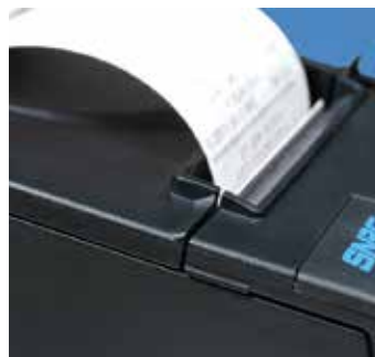
Liquid Guard Built Into the Cabinet Design