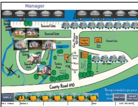
Customized graphical table maps.