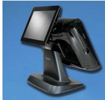
Optional Integrated 9.7" or 7" Rear LCD Customer Displays (Reflection for Windows)