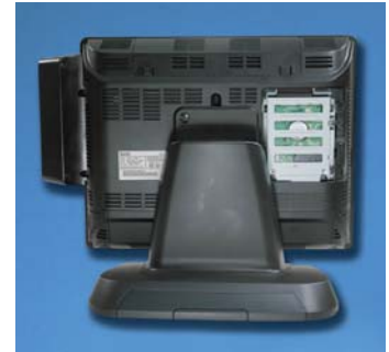
Tool-Free Access to Compact Flash or Hard Disk Drive Optimizes Serviceability