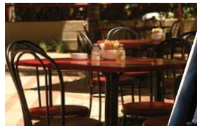
Food Concessions / Fast Casual Restaurants