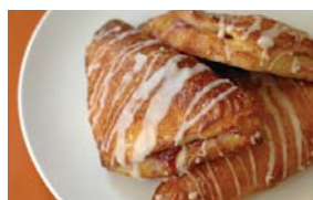
Dusty Environments Like Pizza and Bakeries