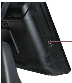
Two USB Ports on the Left Side