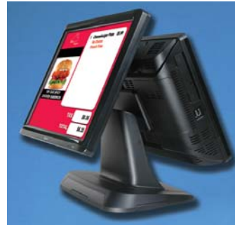
Optional Integrated 15" Rear LCD Customer Display (Reflection for Windows)