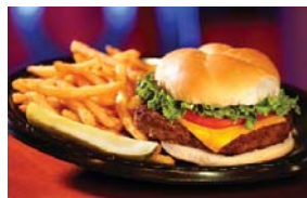
Cafeterias / Table Service / Quick Service