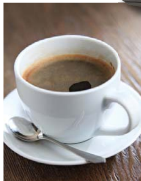
Bars / Ice Cream Parlors / Coffee Shops