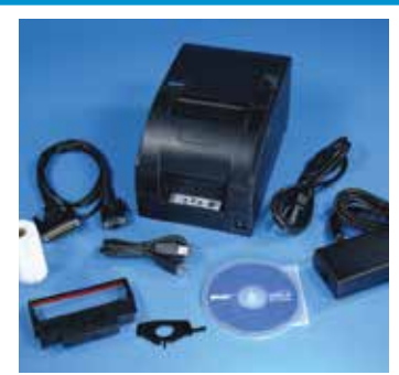
Includes Everything Necessary in the Carton