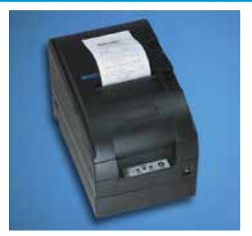
Conceal the Power Supply in the Optional Power Supply Cover