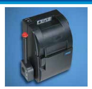
Built-In Wall Mount Capability and Optional Audio/Visual Print Messenger