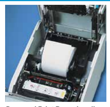
Drop and Print Paper Loading with Built-In Paper Width Selector